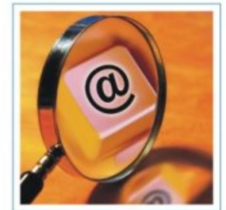
Notified Information Technology Enabled Products / Services under Section 10A

"In exercise of the powers conferred by clause (b) of item (i) of Explanation 2 of section 10A of the Income-Tax Act, 1961 (43 of 1961), the Central Board of Direct Taxes hereby specifies the following Information Technology enabled products or services ( ITES ), as the case may be, for the purpose of said clauses, namely :