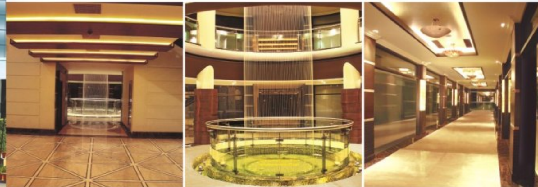
Actual Photographs of Vardhman SNG Plaza

Vardhman SNG Plaza offers its unique brand mix which includes world class brands, products & services in an exclusive shopping ambience. Due to its strategic location It is likely to emerge as a hot shopping destination for all the requirement of a cosmopolitan.